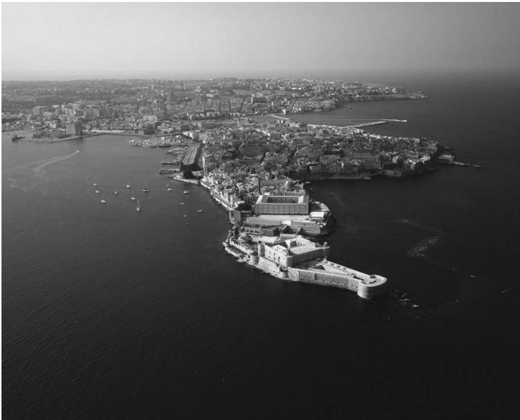
Aerial view of Syracuse