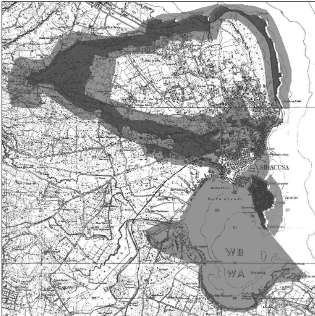
Revised Map showing the boundaries of the nominated property