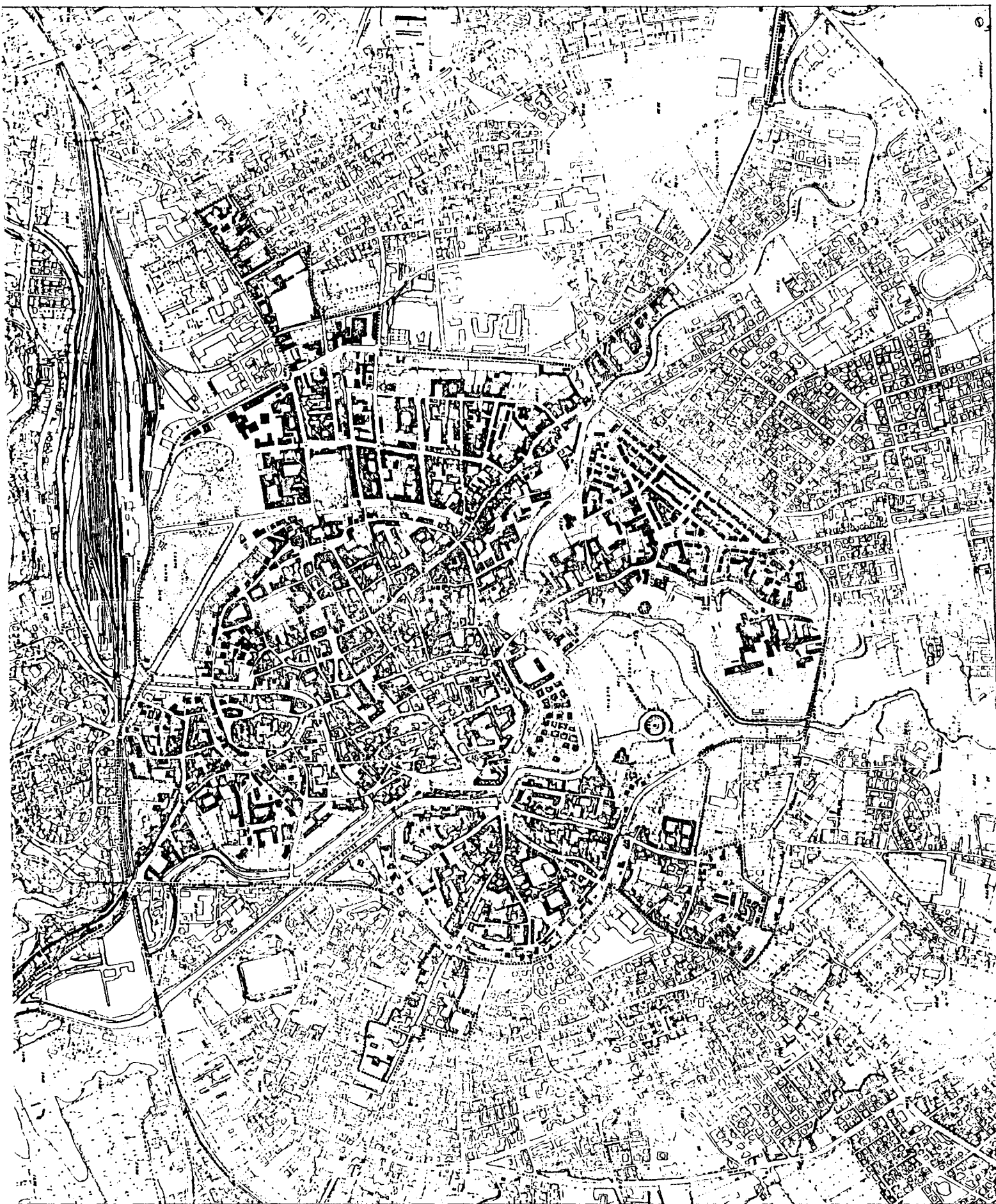
Vicence : plan de la zone protégée / Vicenza : plan of the protected area